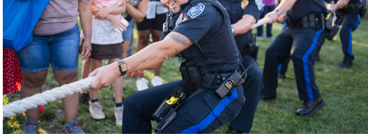
Township of South Brunswick