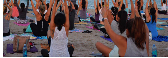
City of Brigantine