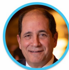
Senator Joseph Vitale , New Jersey Legislature