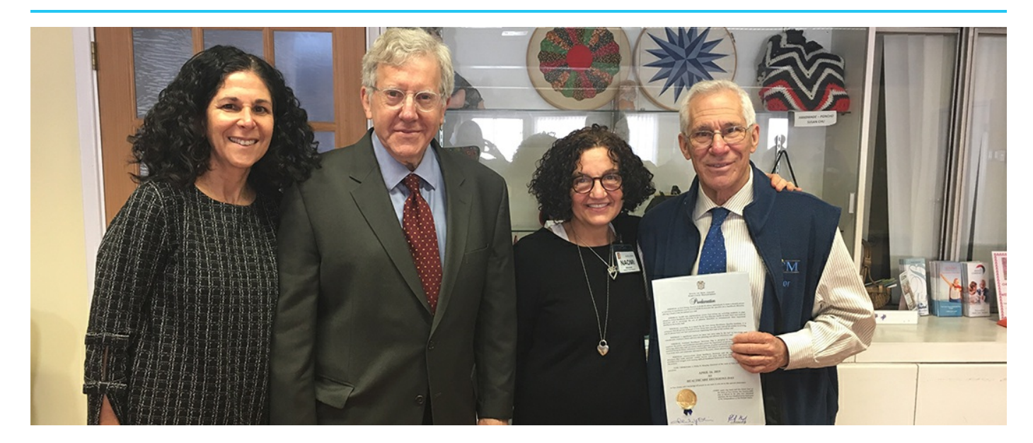
IN THE NEWS Quality Institute's 'Health Matters' Poll Explores New Jerseyans Views on End-Of-Life Care

How can we change New Jersey's culture around death and dying? "Patients, families, and communities must take control. Together we must change the culture...That's what the Quality Institute's Conversation Of Your Life is trying to do."