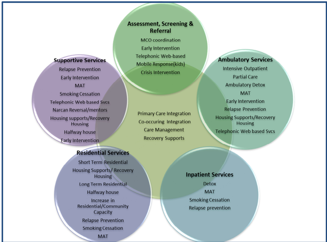
Illustration 2: New Jersey SUD Service Delivery CONTINUUM

New Jersey applied for and was accepted into the Medicaid Innovator Accelerator Program (IAP) Substance Use Disorder (SUD) and Beneficiaries with Complex Needs (BCN) Technical Assistance, which was provided in late 2014 and early 2015. The State applied for these opportunities to inform policy, program and payment reform as it plans the SUD continuum of care in the following areas: identification of a value-based reimbursement methodology that incentivizes better health outcomes through performance metrics, and methods of enhancing our current data analytic capabilities in order to effectively share beneficiary information across different State agencies for better care coordination.